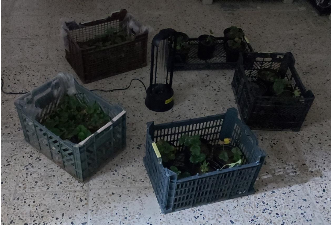
Picture number (1). Shows how to expose strawberry seedlings to UV-C rays using the ultraviolet ray device from the Romanian Braytron company.